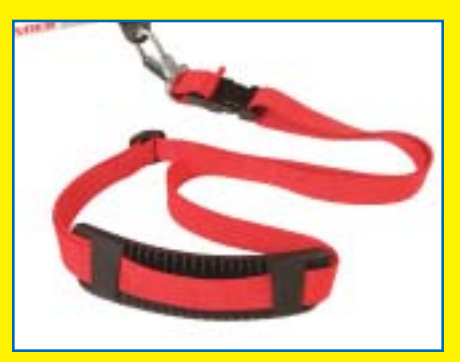
Shoulder strap helps support the weight for less user fatigue.